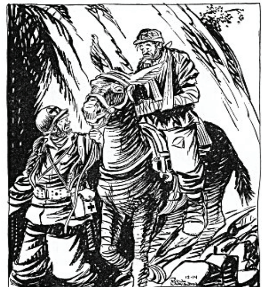
"I calls her Florence Nightingale."

God and the soldier we adore, In time of war and not before; When the shooting's over, And all things righted, God forgotten, and The soldier slighted.